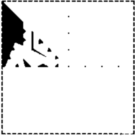
Plate and Broad Branch Crystal